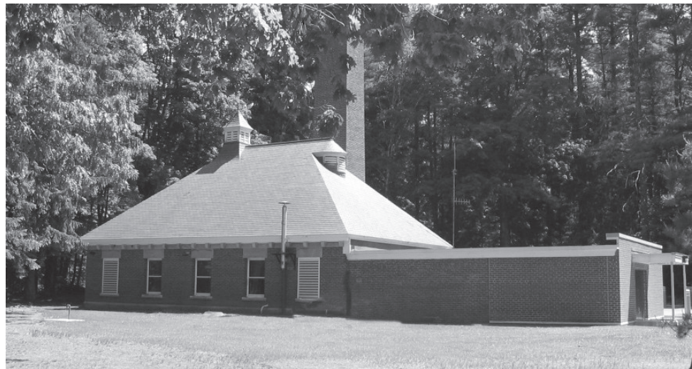
Baddacook Pond Treatment Facility