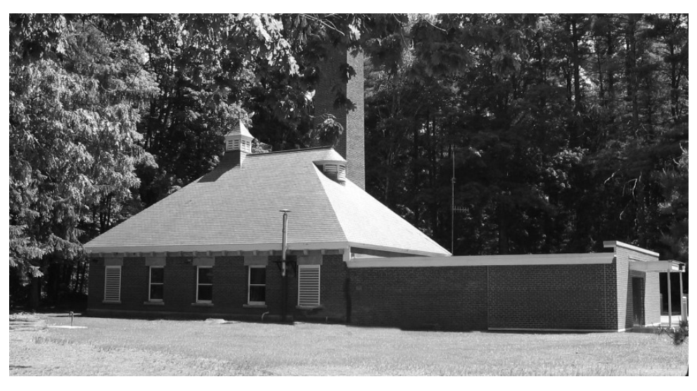
Baddacook Pond Treatment Facility

Water Quality - The Groton Water Department, like all municipal drinking water suppliers in Massachusetts, go to great lengths to insure their customers drinking water is safe to consume. The GWD receives a detailed Water Quality Sampling Schedule from the Department of Environmental Protection every three years that requires us to adhere to a specific water testing schedule. In addition, the GWD staff monitors the water quality of the system on a daily basis to be sure we are in compliance. The Department of Environmental Protection reviews all of our test results to be sure we are within the drinking water parameters they have established. This Consumer Confidence Report identifies those test results that the DEP requires specifically and notes any deficiencies and or violations with regards to drinking water standards that they have established. In 2023, the Groton Water Department received <a href="mailto:no.nd.">no.nd.</a> drinking water violations.