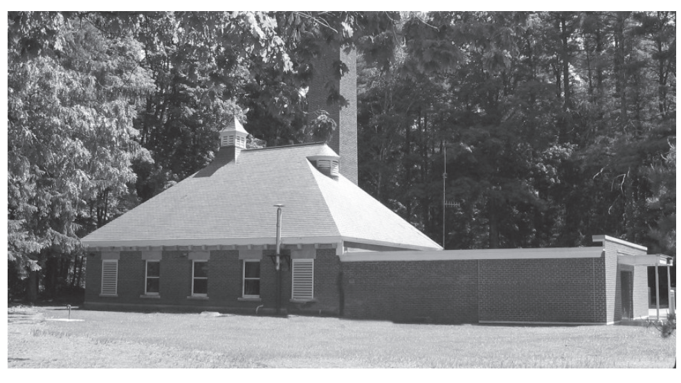
Baddacook Pond Treatment Facility