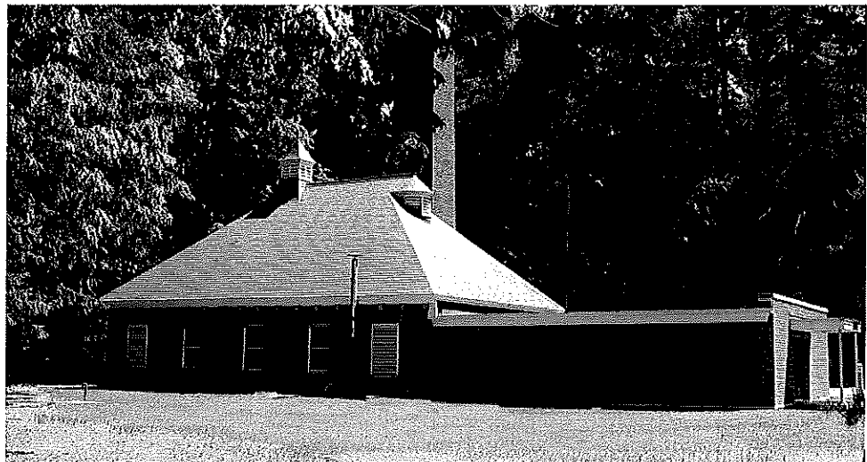
Baddacook Pond Treatment Facility