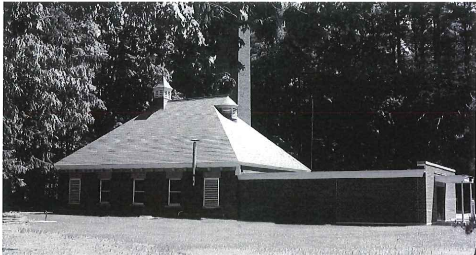
Baddacook Pond Treatment Facility

Respectfully submitted, Thomas D. Orcutt